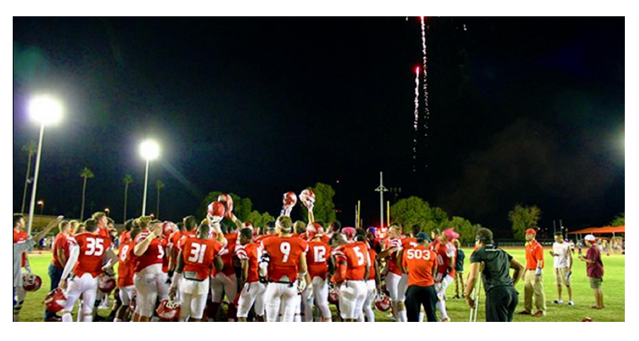
The football team at Mesa Community College is on the verge of losing its program at the recommendation of a district task force.

PHOENIX · A task force that reviewed 10 schoolsqathletics programs has recommended four Arizona community colleges cut football.